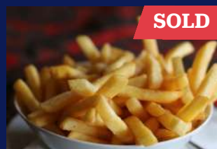
Takeaway Food WAIKATO $98,000