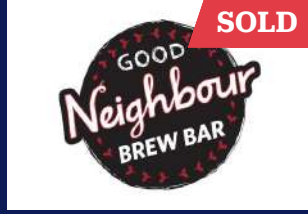
Food/Hospitality HAMILTON $Refer to Broker