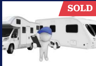
Automotive Business WAIKATO $575,000