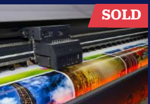
Signage Business WAIKATO $630,000