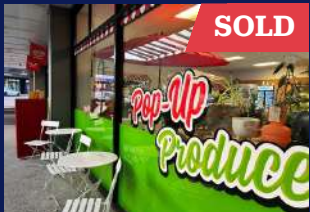
Food Store TAUPO $65,320+SAV