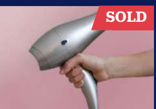
Beauty/Health WAIKATO SURROUNDS $115,000