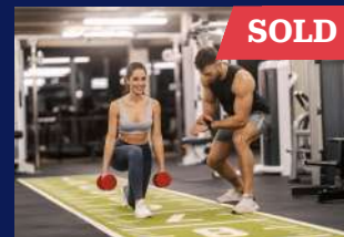
Lifestyle WAIKATO $Refer to Broker