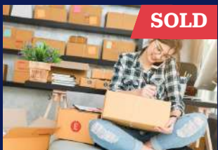
ECommerce TAURANGA $670,000