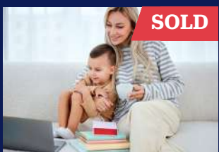
Retail General WAIKATO $300,000