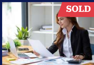
Accounting Services CHRISTCHURCH $800,000